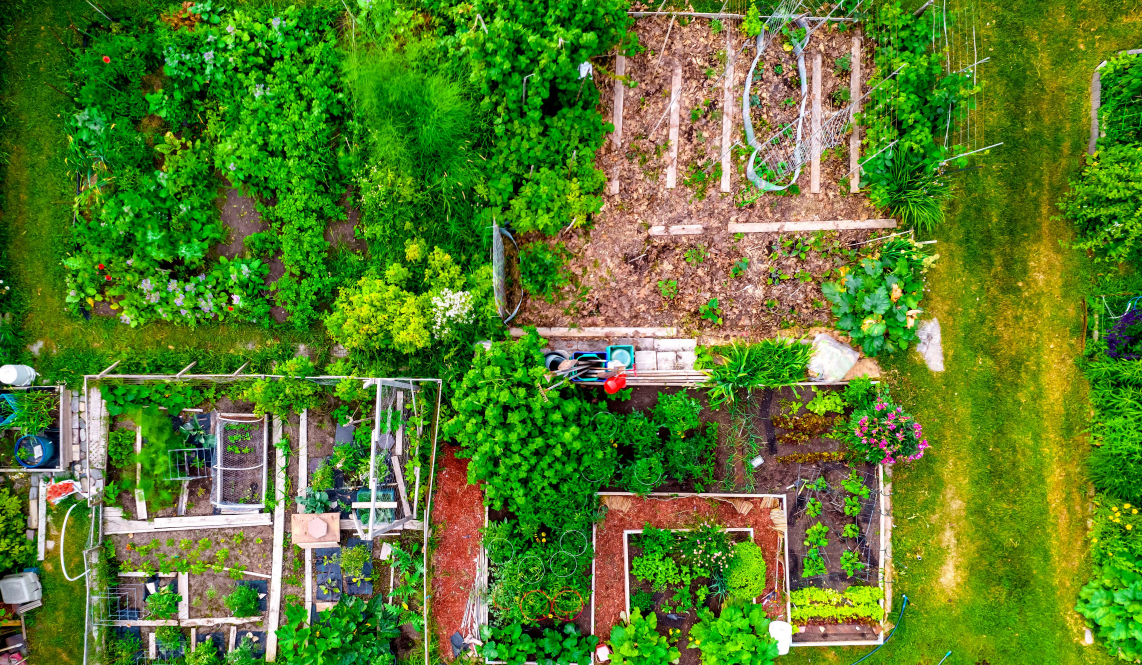
- Permaculture and the College of Agricultural Sciences had another stellar year -